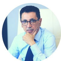
AMINE BOUABID CEO Bank of Africa